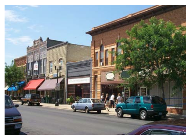
Example of a change in building facades and rooflines.

2. Mechanical equipment, satellite dishes, and other utility hardware, whether located on the roof or exterior of the building or on the ground adjacent to it, shall be screened from the public view and with materials identical to or strongly similar to building materials or by heavy landscaping that will be effective in winter or they shall be located so as not to be visible from any public way. In no case shall wooden fencing be used as a rooftop equipment screen.