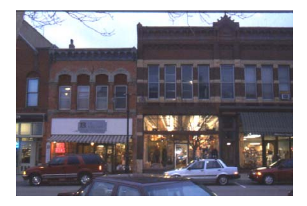
Example of changes in building facades and massing