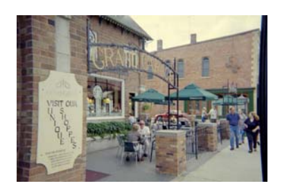
Example of a building at 0 feet Illustration of building setback with public plaza provision